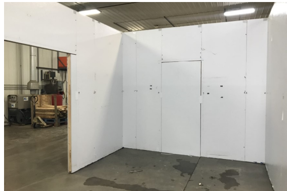
11'3" x 20'1" x 10' H Cooler or Freezer