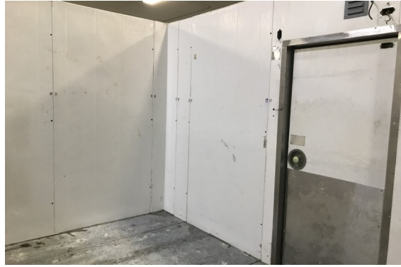
10' x 16' x 8'10" H Cooler With Floor