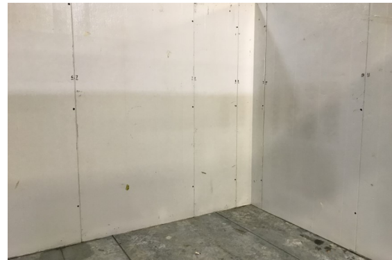
10' x 16' x 8'10" H Cooler With Floor