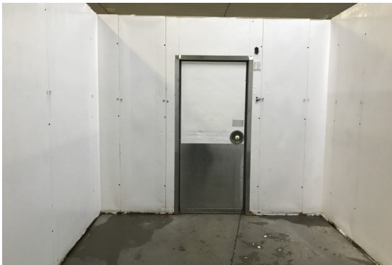
10' x 16' x 8'6" H Cooler or Freezer