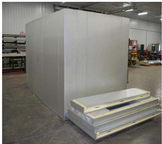
7' x 12' x 7'6" (with unit on top 9'2" H) Walk-In Cooler or Walk-In Freezer