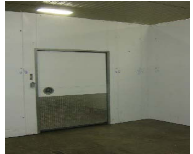
18' x 18' x 10'4" H Orange Walk-In Cooler with Glass Doors