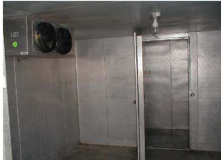
12' x 25' x 9'7" H Walk-In Combination Cooler / Freezer