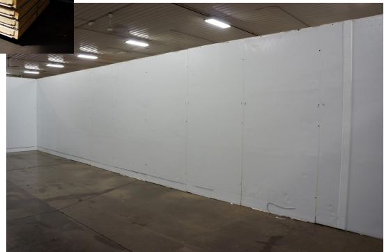
17'4" x 39'9" x 9' H Cooler or Freezer