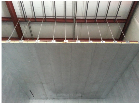
36'6" x 48' x 18'2" H Cooler or Freezer