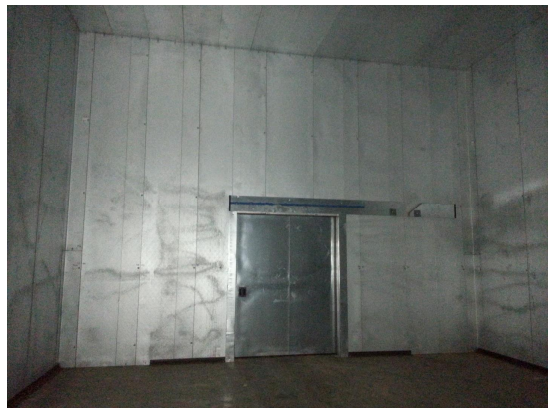
36'6" x 48' x 18'2" H Cooler or Freezer