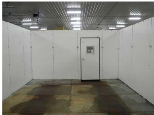
14'6" x 40'8" x 8'6" H Combination Walk-In Cooler/Freezer with Floor