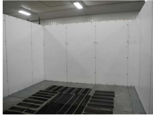
14'6" x 40'8" x 8'6" H Combination Walk-In Cooler/Freezer with Floor