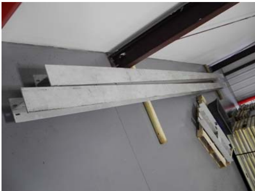
24' x 39'6" x 14'4" H (15'4" with ceiling support beam) Drive-In Cooler or Freezer