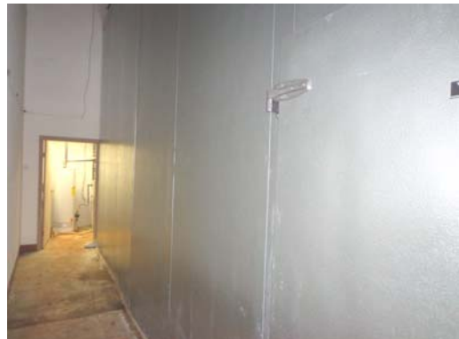
24' x 39'6" x 14'4" H (15'4" with ceiling support beam) Drive-In Cooler or Freezer