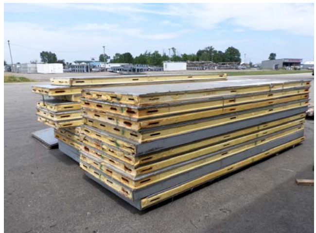
25'2" x 33'11" x 11'7" H Combination Walk-In Freezer With Floor