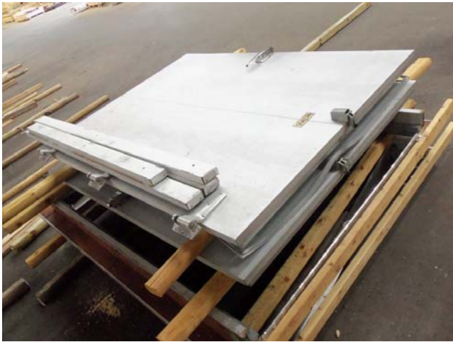
25'2" x 33'11" x 11'7" H Combination Walk-In Freezer With Floor