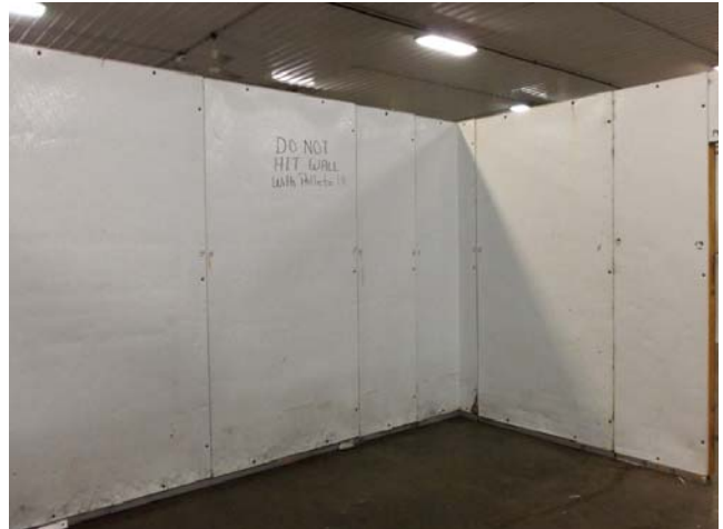
16'4" x 21'2" x 8'5" H (9'3" with beam) Walk-In Cooler