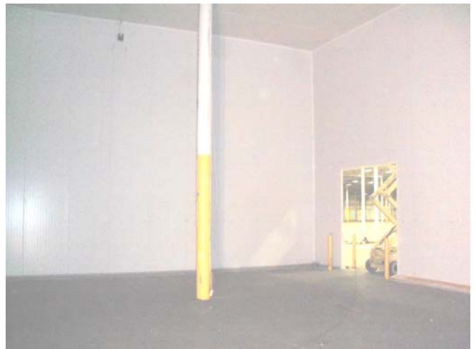
60'3" x 65'3" x 24'3" H Drive-In Cooler or Freezer