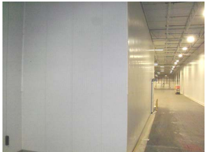
60'3" x 65'3" x 24'3" H Drive-In Cooler or Freezer