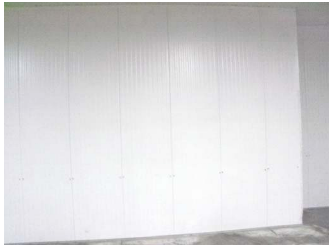
56'2" x 88' x 18' H Drive-In Cooler or Freezer