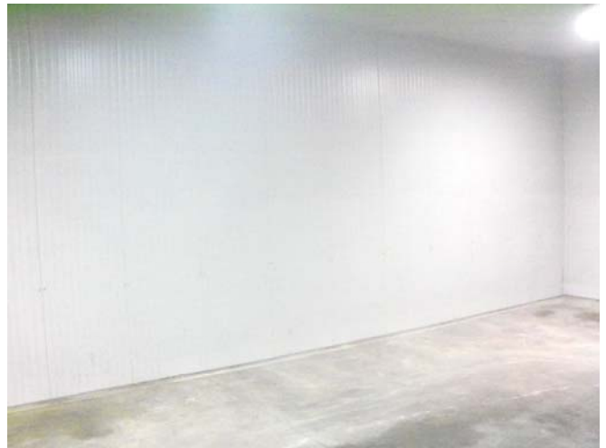
56'2" x 88' x 18' H Drive-In Cooler or Freezer