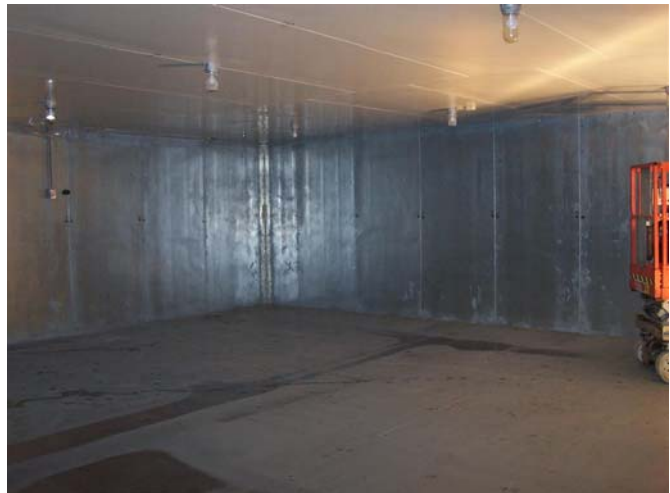
30'9" x 32'8" x 9'11" H Walk-In Freezer with Floor