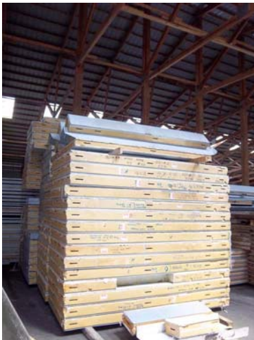
30'9" x 32'8" x 9'11" H Walk-In Freezer with Floor