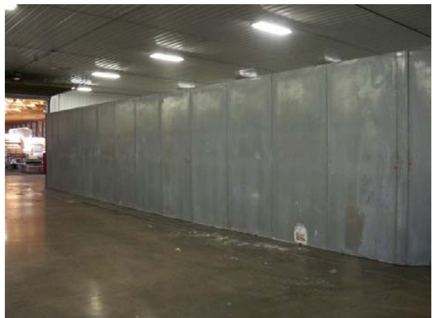
15'4" x 50'9" x 10' H Combination Walk-In Cooler/Walk-In Freezer