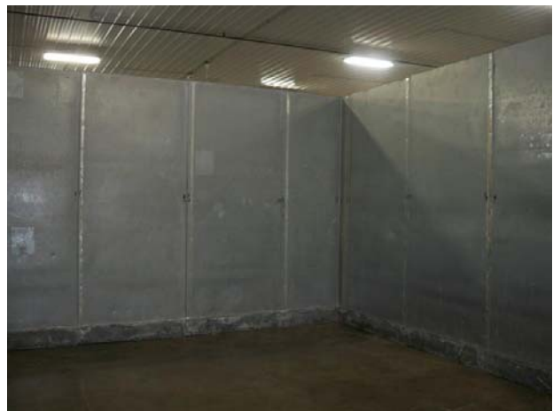
15'4" x 50'9" x 10' H Combination Walk-In Cooler/Walk-In Freezer