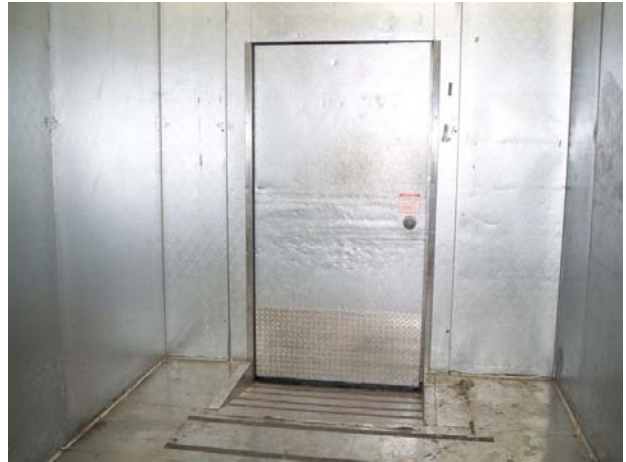
8'7" x 28'1" x 10'6" H Combination Walk-In Cooler/Freezer