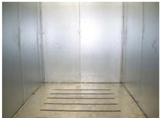
8'7" x 28'1" x 10'6" H Combination Walk-In Cooler/Freezer