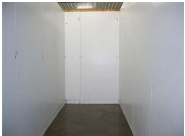
14' x 20' x 10' H Combination Walk-In Cooler/ Walk-In Freezer