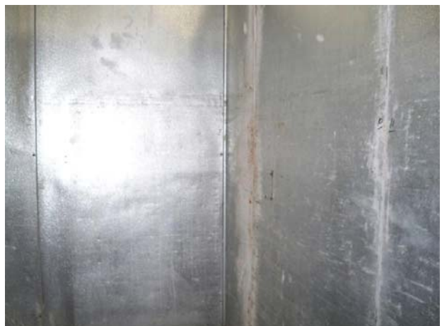
8'2" x 11'2" x 9'4" H Walk-In Cooler or Walk-In Freezer