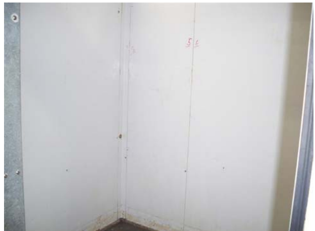
5'11" x 13'11" x 9' H Combination Walk-In Cooler/ Freezer