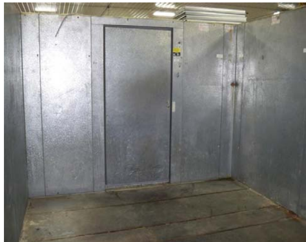
10' x 28' x 7'7" H Walk-In Combination Cooler/ Freezer