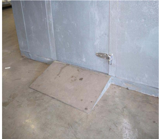
10' x 28' x 7'7" H Walk-In Combination Cooler/ Freezer