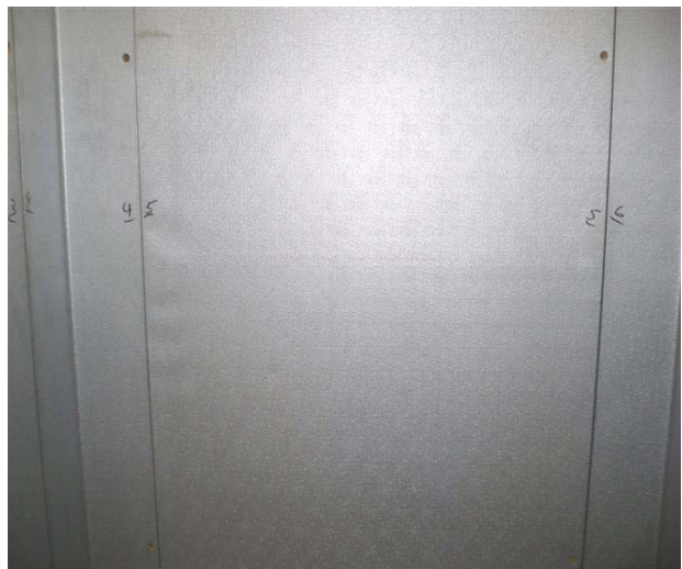
5'10" x 7'9" x 7'6" H (9'3"H with unit) Walk-In Freezer with Floor