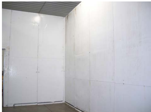
33' x 35'10" x 14'1" H Combination Walk-In Cooler / Walk-In Freezer