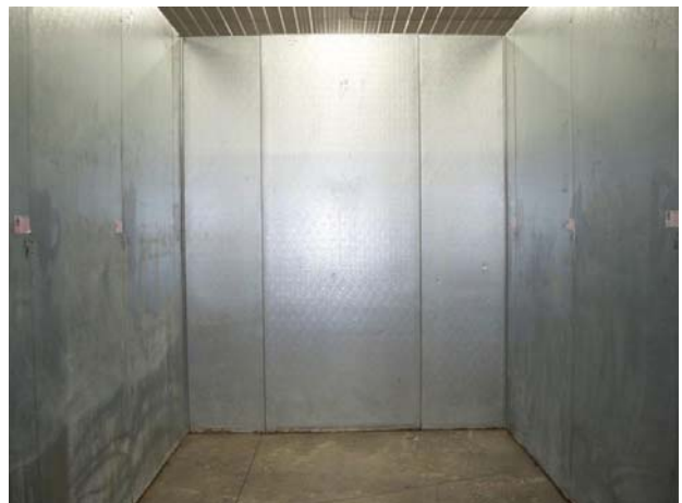
8'8" x 31' x 10'3" H Walk-In Combination Cooler / Freezer