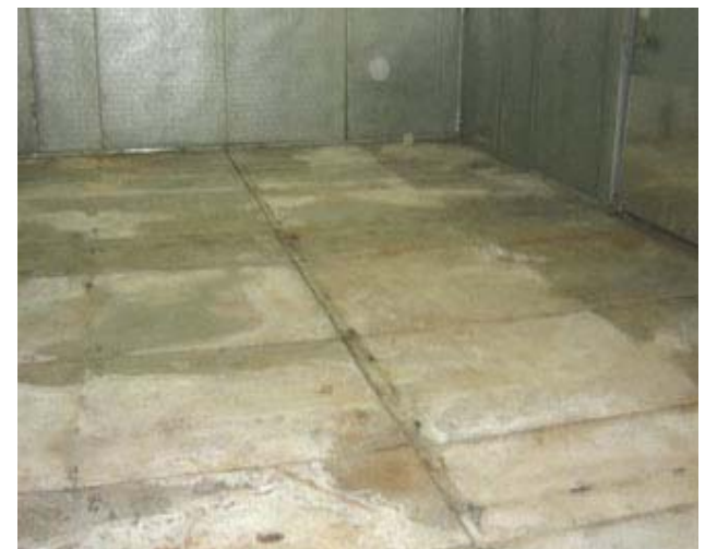
16'9" x 34'9" x 9'6" H Walk-In Freezer with Floor