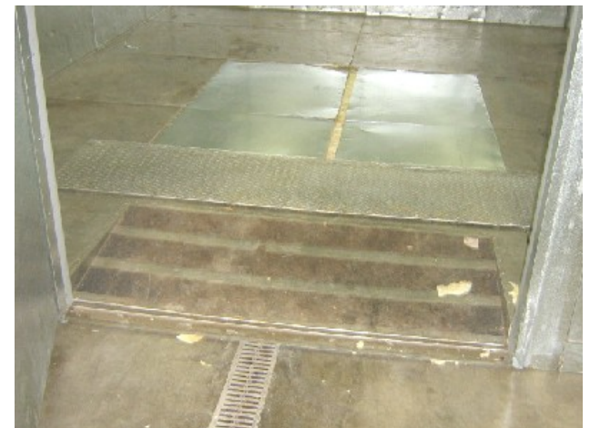
13'6" x 17'4" x 9'6" H Walk-In Freezer with Floor