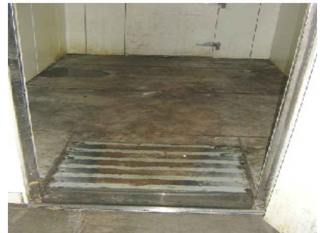
7'9" x 25'11" x 8'6" H Combination Walk-In Cooler / Freezer