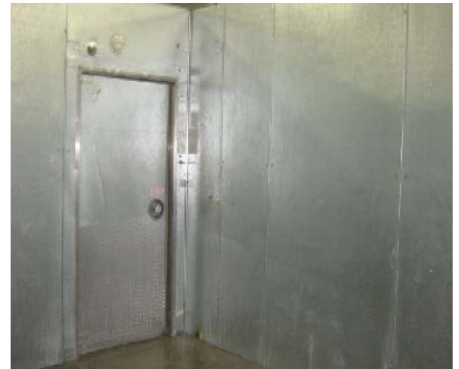
12'2" x 33'7" x 9'5" H Walk-In Combination Cooler / Freezer